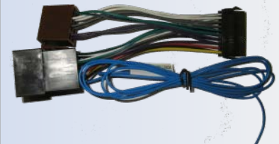
ISO to EVH-xxx Adapter Harness (ESA-005)