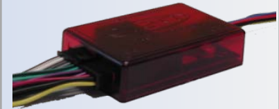
Elan Intelli-Mute Module (EMB-000)